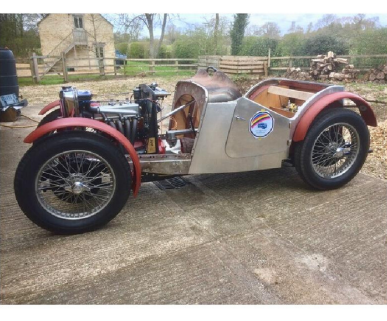
Nigel Harper's J2 MOT when?