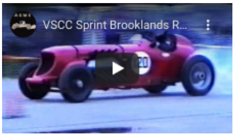
VSCC Sprint at Brooklands