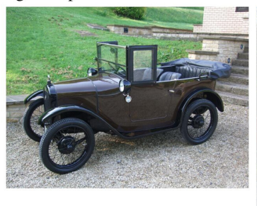
Tim Wadsworth Go Shell - where?