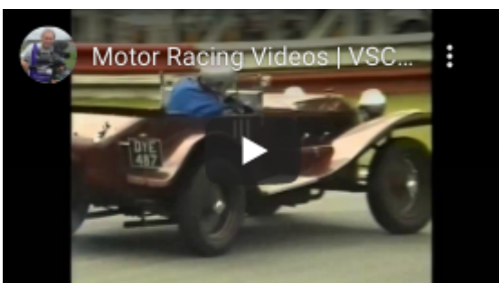
From Mallory Park, 1993