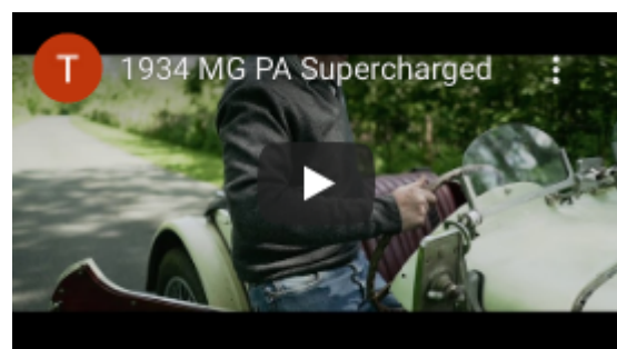
An MG recently sold by THL