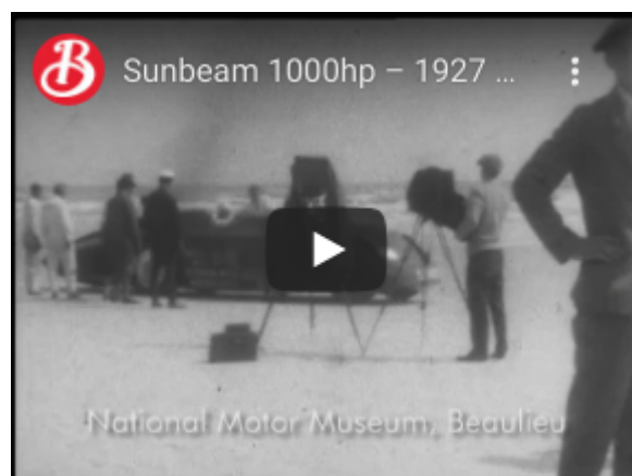
1927 World Land Speed Record