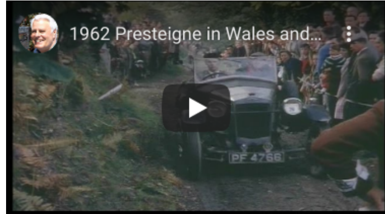
A visit to Wales