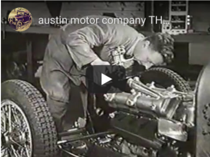
The Austin 7