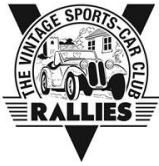
Table Top Rally edition 8: Worcestershire Wander

Starting from Martley Church at 756598 N