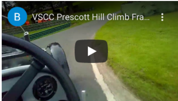
Prescott in a Nash