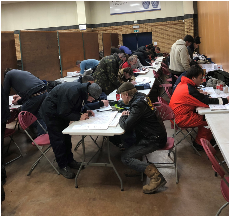
Table top rallies

Almost 5,000 people have now signed the petition to re-open Madeira Drive and the petition will be presented to the full council on 23 July. The petition runs until 22 July so if you wish to add your voice to those who want to protect the Brighton Speed Trials and the businesses on Madeira Drive you can sign the e-petition here .