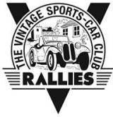
Table Top Rally edition 9: Proper 'ansum

Use coloured roads only (though junctions with white roads are used in section 1; ignore them thereafter). Use the longest route in GS 0469. Enjoy the lanes and ee'll be back dreckly.