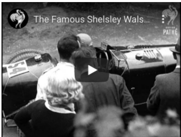
Shelsley in 1933