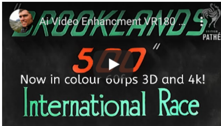
Brooklands in Colour