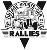
Table Top Rally edition 11: Royal Garden Party Rally

CRO (Coloured Roads Only) unless indicated. All one-ways, no right turns etc. have been suspended for this event.