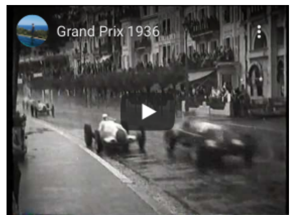
1936 Grand Prix

Please complete the National Historic Vehicle Survey to keep transport heritage on our roads.