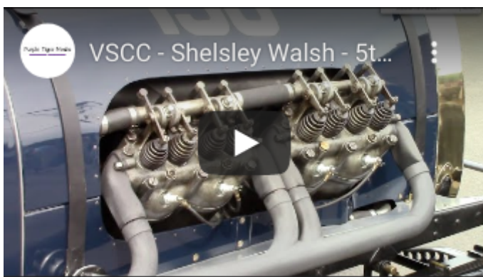
VSCC Shelsley Walsh - 2015