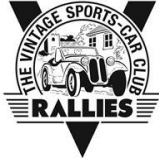
Table Top Rally edition 13: The Answer is Out There Somewhere

Still socially distancing, we are starting (almost) in the middle of nowhere, aka Baxter's Fm at 206087