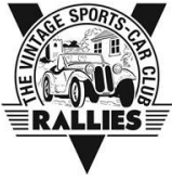
Table Top Rally edition 14: A Wander in Wales