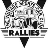
Table Top Rally edition 14: A Wander in Wales