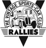
Table Top Rally edition 15: Masham virtual rally

CRO = Coloured Roads Only; CAR = Consider All Roads; LWR = Long Way Round Map references for start and end of sections are approximate