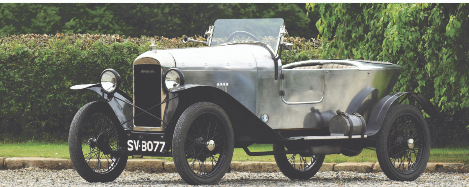
1925 Amilcar C4 Petit Sport.