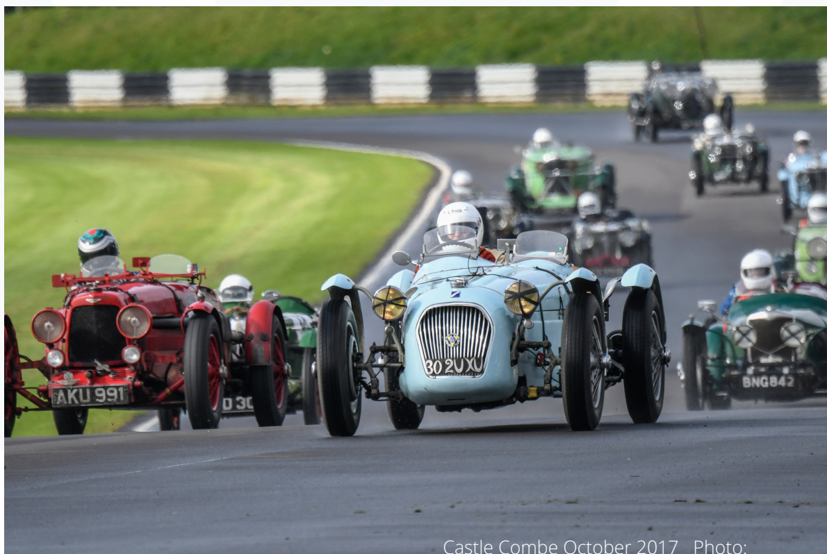
Castle Combe October 2017