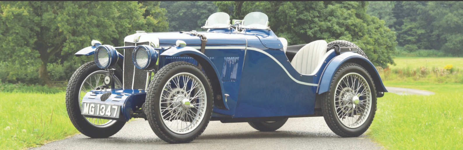
1931 MG D type supercharged. £28,000

Contact 01200 538866 for more info on how to acquire either of these two. Stay safe my friends