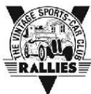
Table Top Rally edition 17: On the Border

This Week's Table Top Rally Comes To You Courtesy Of Toby Galbraith, Taking Us to One Of The Most Stunning Parts Of the Country, The Devon/Cornwall Border On The Edge Of Dartmoor