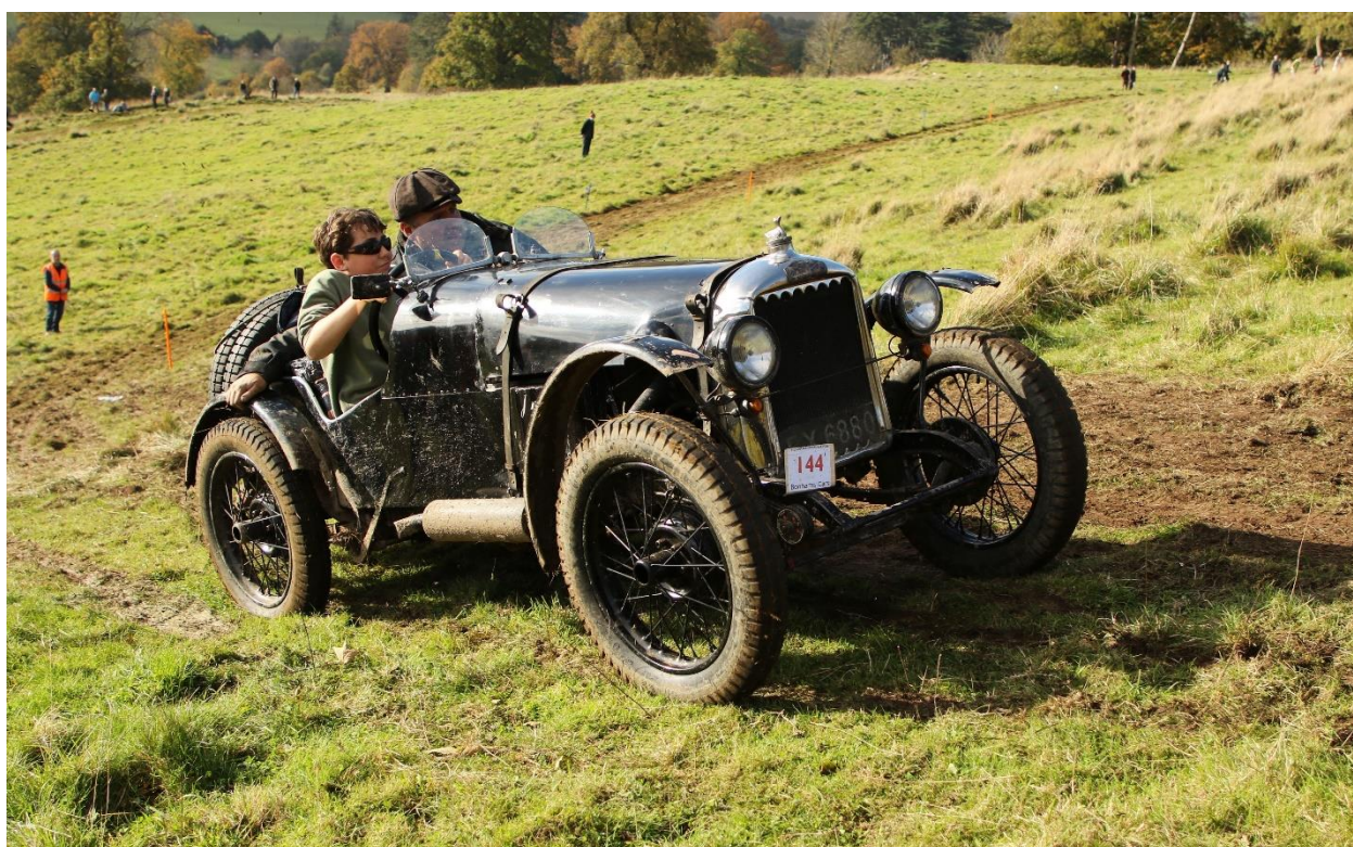
Freddie Owen hustling 'Jemima' the Owen family trials car to an impressive score